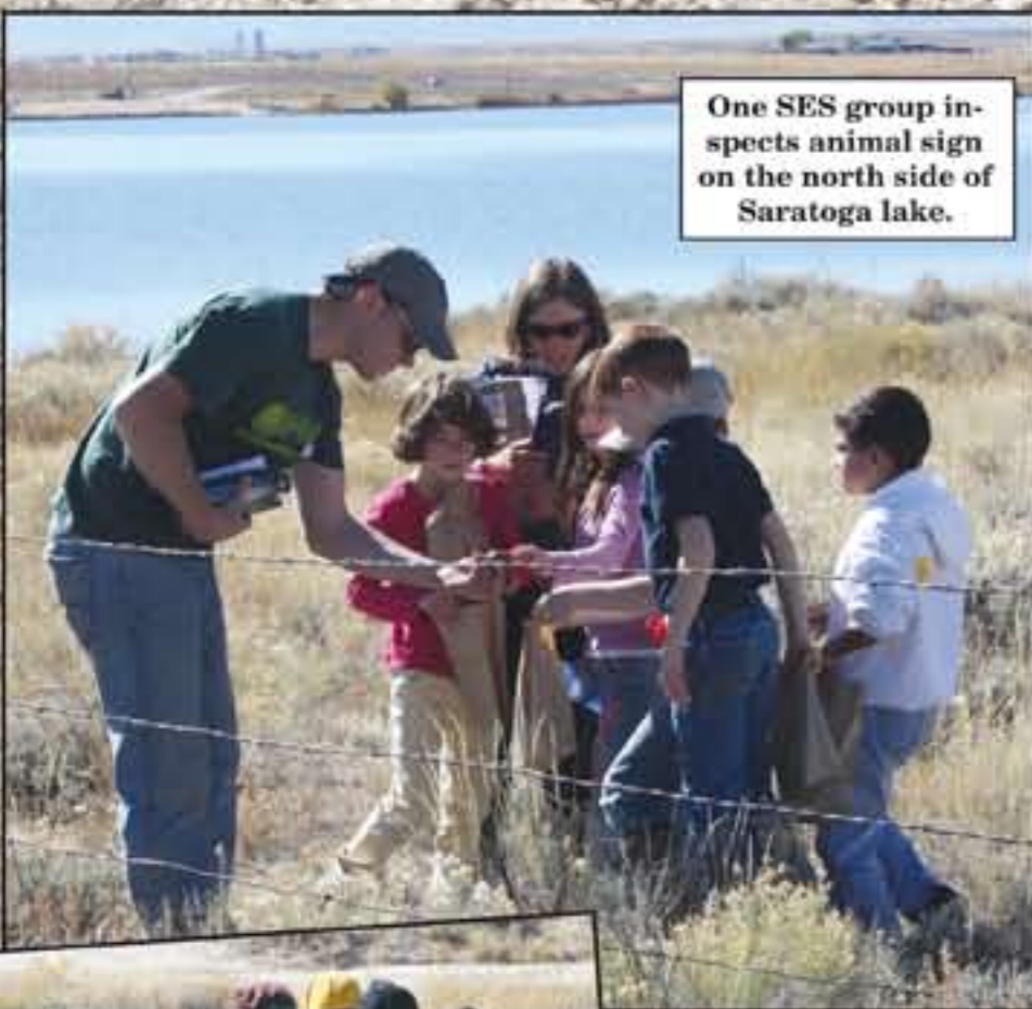
One SES group inspects animal sign on the north side of Saratoga lake.