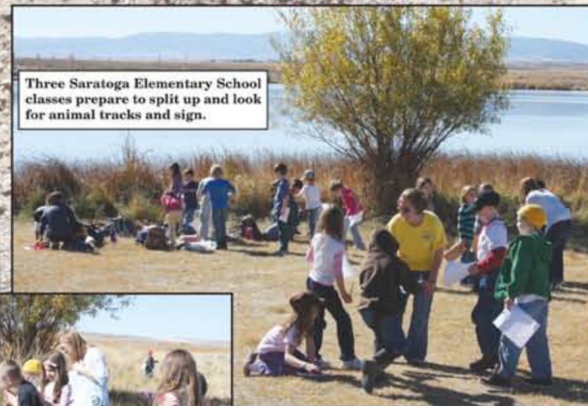
Three Saratoga Elementary School classes prepare to split up and look for animal tracks and sign.