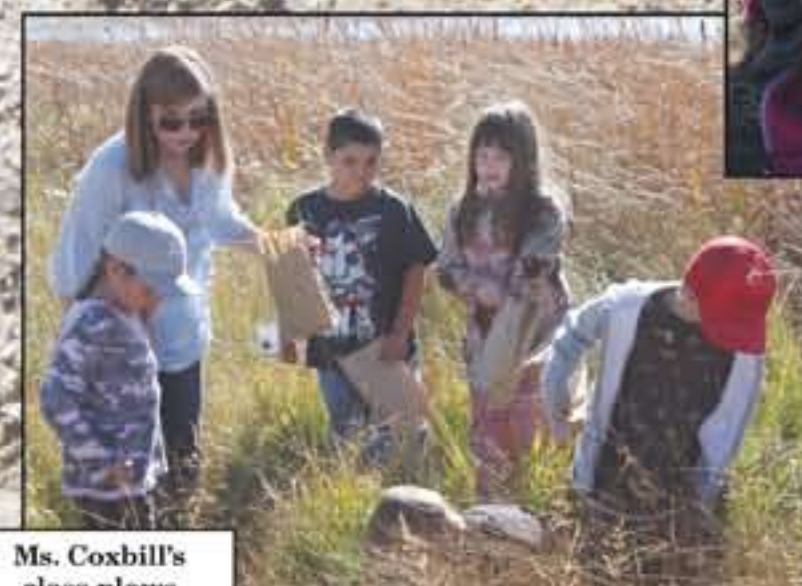
Ms. Coxbill's class plows through tall reeds and grass in their quest for signs of animal habitation.